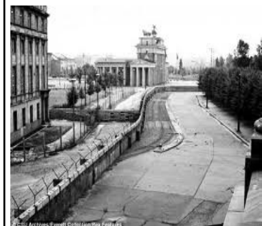
The Great Berlin Wall