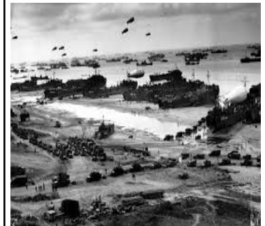
Allied troops land in Normandy France

1948 – One of the most dramatic standoffs in the history of the Cold War begins as the Soviet Union blocks all road and rail traffic to and from West Berlin. The blockade turned out to be a terrible diplomatic move by the Soviets, while the United States emerged from the confrontation with renewed purpose and confidence. Following World War II, Germany was divided into occupation zones. The United States, Great Britain, the Soviet Union, and, eventually, France, were given specific zones to occupy in which they were to accept the surrender of Nazi forces and restore order. The Soviet Union occupied most of eastern Germany, while the other Allied nations occupied western Germany. The German capital of Berlin was similarly divided into four zones of occupation.