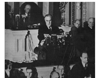
"A Day Which Will Live in Infamy"