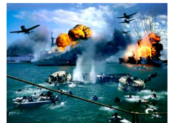
Recreation of attack on Pearl Harbor

In total American forces took 89,500 casualties with 19,000 killed and 23,000 missing.