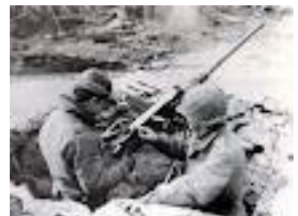
Battle of the Bulge