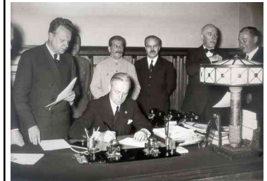
Germany and Russia Sign Pact

After a vicious two-day popular uprising sparked by the approach of Allied forces, Paris is finally liberated from four years of German occupation when the French 2nd Armored Division enters the city. Most Allied units in pursuit of the retreating Germans go around the city to avoid thoroughfares jammed with jubilant Parisians.