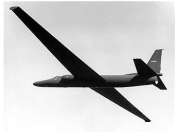
American U-2 Reconnaissance Plane

Also in May, on the 15th of May, 1963, the last and longest of the Project Mercury flights occurred. Major Leroy Gordon Cooper Jr. USAF, orbited the earth 22 times in an MA-9 "Faith-7" capsule. Cooper made a manual re-entry after the automatic control system failed. He was the first American to orbit the earth for more than a day, spending 34 hours, 20 minutes and 9 seconds in flight.