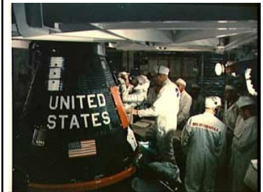
Gordon Cooper enters the "Faith 7"